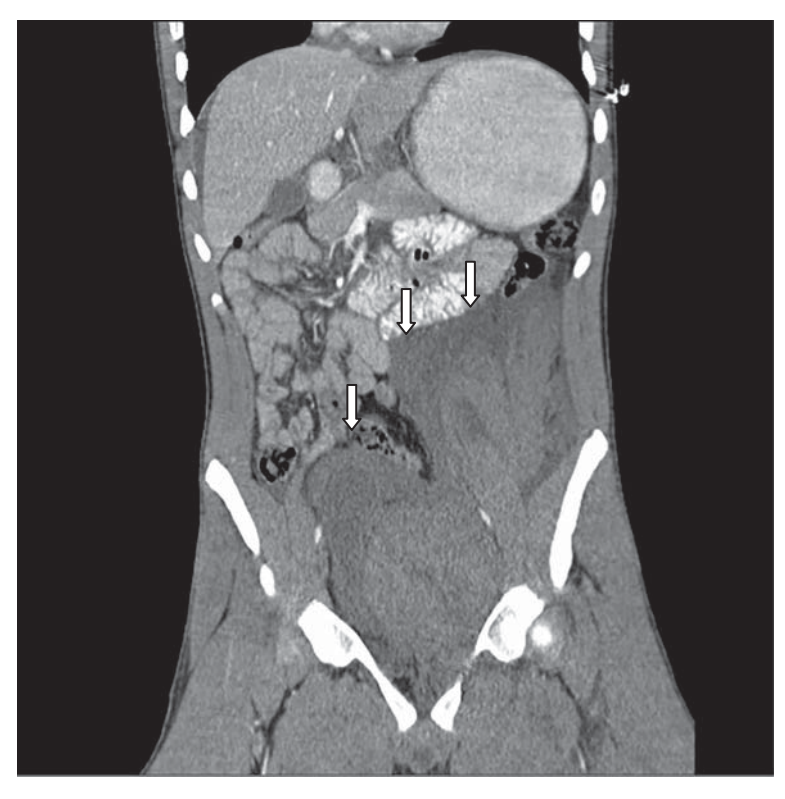
Figure 1. Enhanced CT shows extraperitoneal haematoma (below arrows).

All blood tests were normal except low haemoglobin. An urgent abdominal and pelvic ultrasound scan was performed as per trauma protocol, which showed a large pelvic haematoma extending into the upper abdomen with normal liver, gallbladder, kidneys and spleen, and no intraperitoneal fluid. Subsequently, a CT scan was done to ascertain the diagnosis and provide more information about the abdominal organs. It revealed evidence of an extraperitoneal haematoma, active bleeding, as well as intraperitoneal collection (Figure 1). This coronal image showed extraperitoneal free fluid inferior to small bowel loops extending to the left iliac fossa with deviation of the bowel to the right. While in A&E, he became increasingly tachycardic and hypotensive. An emergency laparotomy was decided due to lack of angiographic facilities.