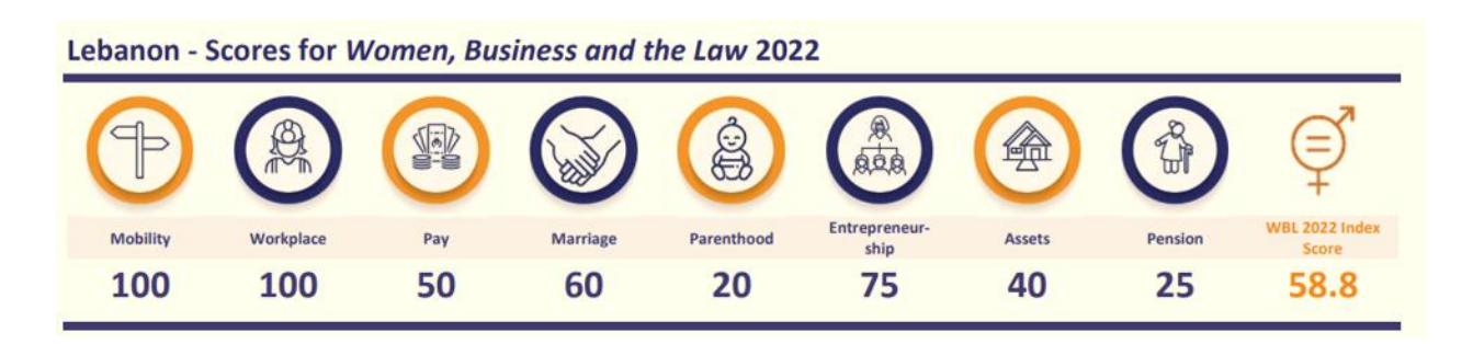
Figure 5: Women, Business, and Law Index in Lebanon