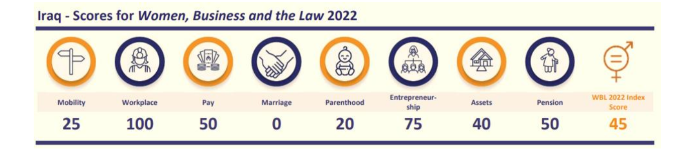
Figure 6: Women, Business, and Law Index in Iraq

These figures from the Women, Business, and the Law Index (2022) show that Venezuela scores the highest total score, compared to Lebanon and Iraq, amidst having the worst economic crisis. Moreover, the three countries have scored 100 out of 100 on the "workplace" indicator. However, Lebanon and Iraq have scored way less than Venezuela on the "Marriage",