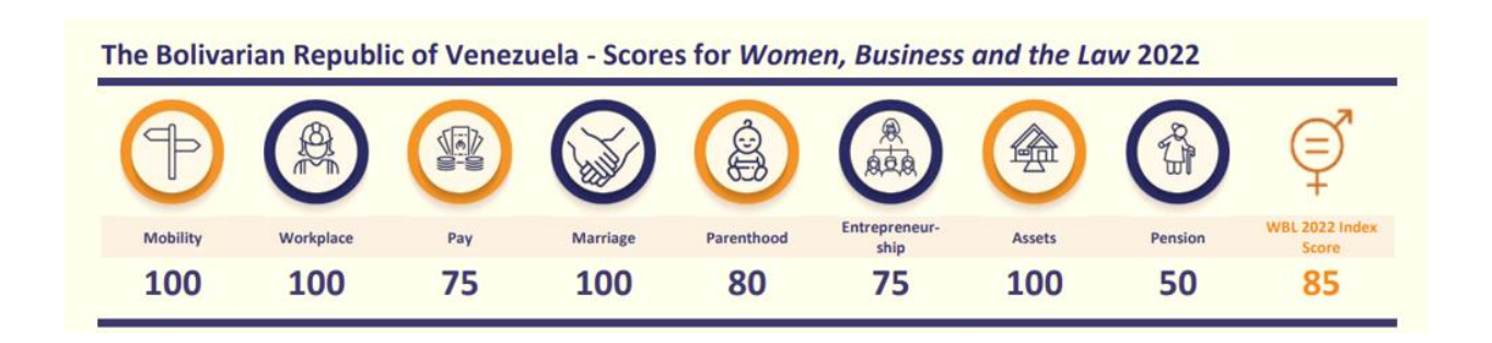
Figure 4: Women, Business, and Law Index in Venezuela