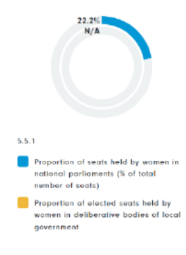
Figure 2: Political Participation of Women in Venezuela