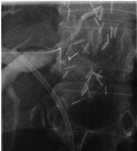
FIGURE 2: Cholangiogram showing the guide wire (arrow) during unsuccessful attempts to cross the anastomotic obstruction.

on the right graft. The common hepatic bile duct was left on the right graft. The patient was transplanted using the piggy-back technique without a veno-venous bypass. The biliary tract was reconstructed performing a duct-to-duct anastomosis using a T-tube by our standard technique previously described [5].