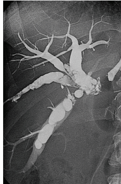
FIGURE 3: Intraoperative cholangiogram showing the complete filling with glue of excluded intrahepatic bile ducts.

A cholangiography through the T-tube was performed on postoperative day 14, and the T-tube was clamped before patient discharge. Three months after A/PSLT the T-tube was removed after a cholangiography with normal findings. One year after transplant the patient showed abnormal liver function tests, hyperbilirubinemia, leukocytosis, and elevated g-glutamyl transpeptidase (GGT), and mild elevation in alanine transaminase (ALT). The patient underwent a doppler ultrasound that showed (a patent hepatic artery) an intrahepatic bile duct dilatation and an anastomotic biliary