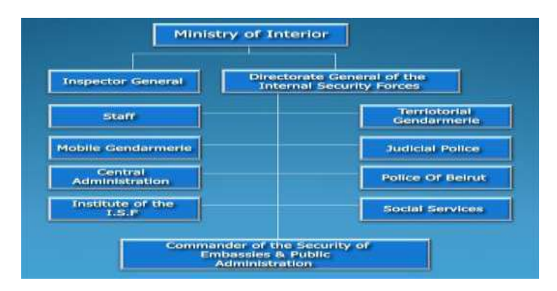
Figure 3.1: Organizational structure of the ISF

discipline, thanks to the efforts of the French delegation that carried out its mission during 23 years" (ISF, 2009, sec. 5.1). On the 12<sup>th</sup> of June 1959, by the decree NR 138, the establishment of the first directorate for the Internal Security Forces in Lebanon occurred. Currently, the new structure of the ISF is organized as follows: